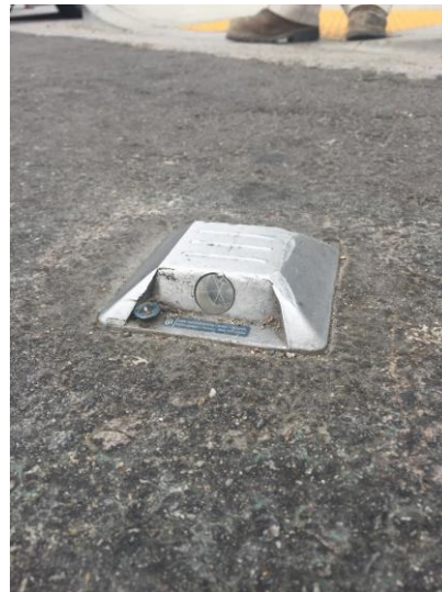
Street instrumentation target similar to lane marker but has an initial recorded elevation camera shoots signal to reflective prism