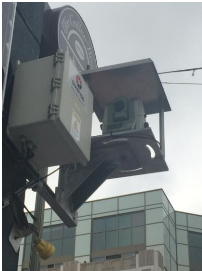
Survey camera shoots signal and reads current elevation of street target